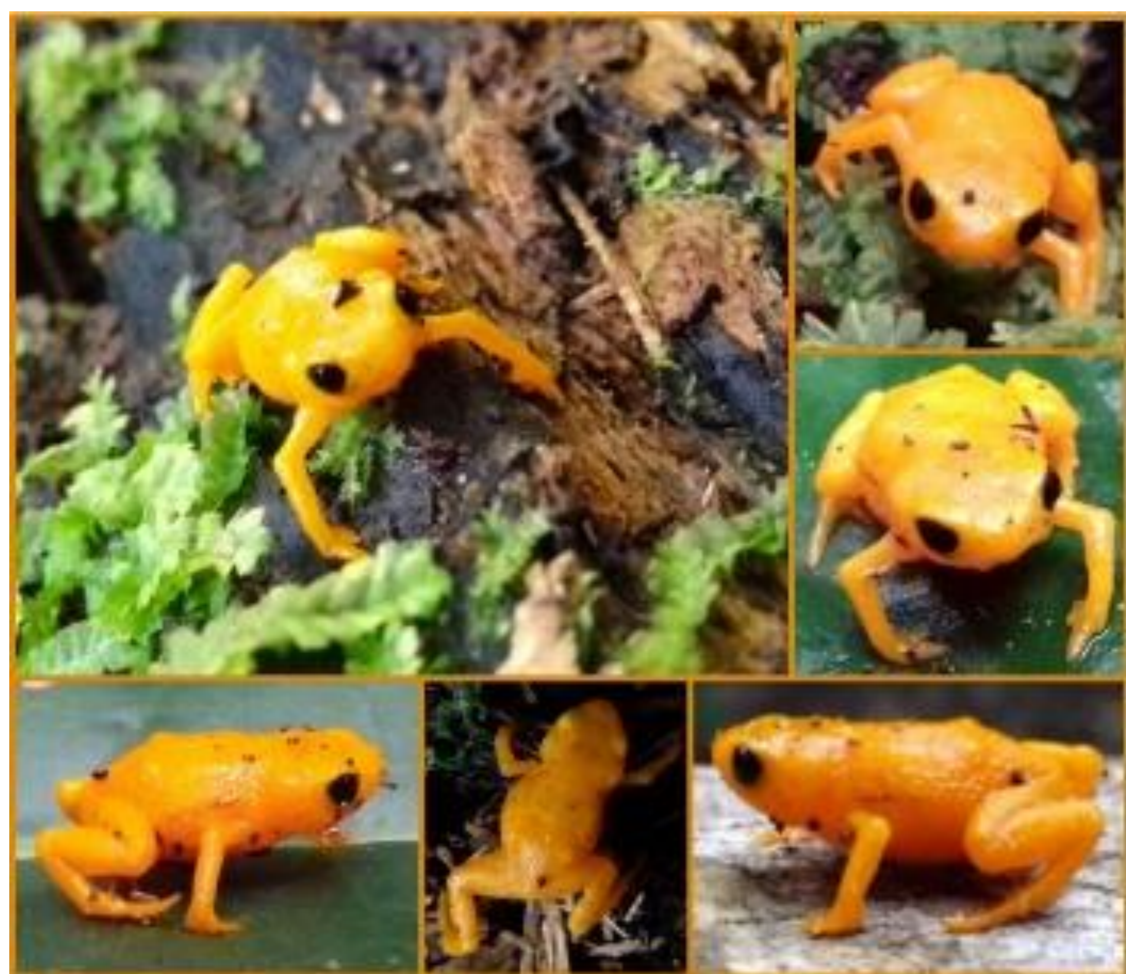
Figure 1 - Brachycephalus ephippium

The microbiota it's a set of microorganisms that inhabit organs or tissues of a body 1 . Recent studies show that microorganisms play an important role in the development of the immune system 2, 3 . Several factors among them the habitat is an important component in this microbial community composition in the skin of anuran. It is necessary to characterize the local microbiota for the conservation and maintenance of species 4 . The Brachycephalus ephippium is a frog endemic to Brazil, found in forested areas of the Mantiqueira, Serra do Mar and Atlantic Forest, extending from Bahia to Paraná. This species is considered as an environmental indicator and is studied due to the presence of Tetrodotoxin (TTX) on the skin, but there are no studies on the characterization of the microbiota of this species' skin 5, 6 .